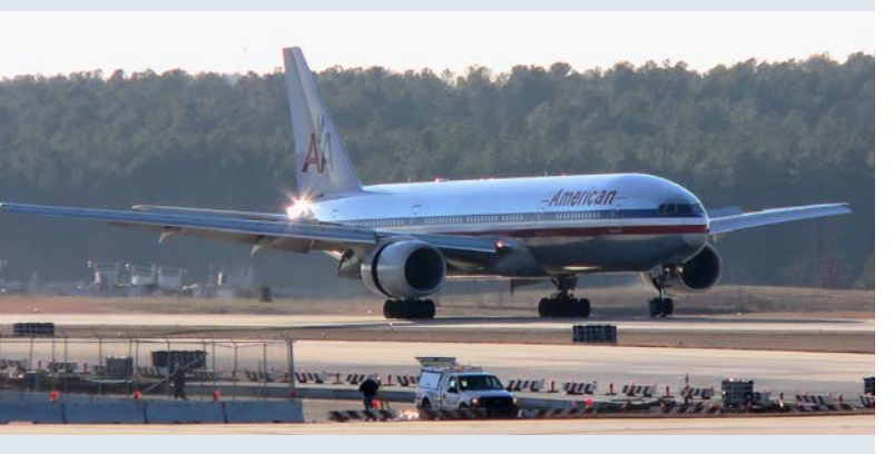
and close proximity to Research Triangle Park and Raleigh-Durham International Airport.

Town community members passionate about supporting the Tar Heels and showcasing their Carolina Blue are equally passionate about equity and inclusion, environmental sustainability, and affordable housing.