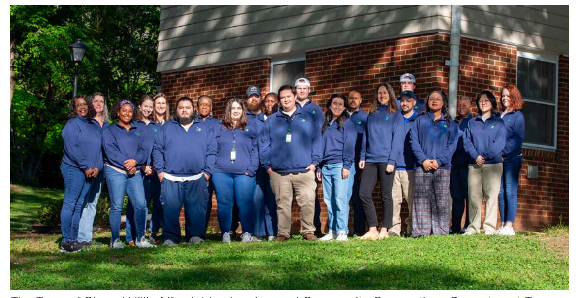
The Town of Chapel Hill's Affordable Housing and Community Connections Department Team

The Town of Chapel Hill is an Equal Opportunity Employer.