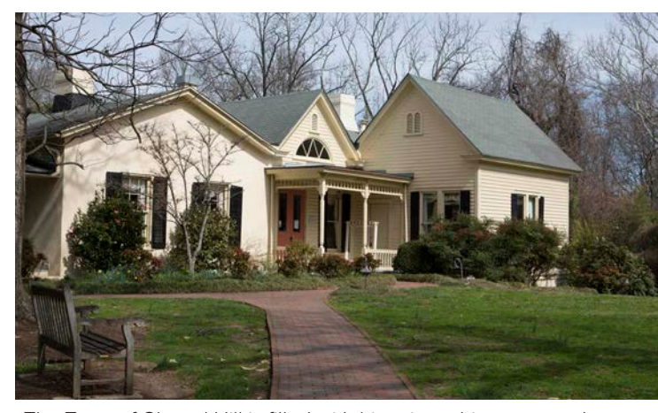
The Town of Chapel Hill is filled with historic architecture, such as the Horace-Williams house, built in 1854 and today, providing meeting and event space, art exhibitions, and public education programs.

Chapel Hill is a recognized pioneer in education, research, and innovation — a place where ideas are born. Home to brilliant minds, award-winning restaurants, innovative businesses, highly rated public schools, museums, galleries, festivals, and athletic events, and a vibrant music and performing arts scene, community members and visitors have abundant opportunities in this creative town. The Town's fare-free transit system provides community members with accessible transportation.