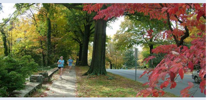
pedestrian-friendly neighborhoods . . .