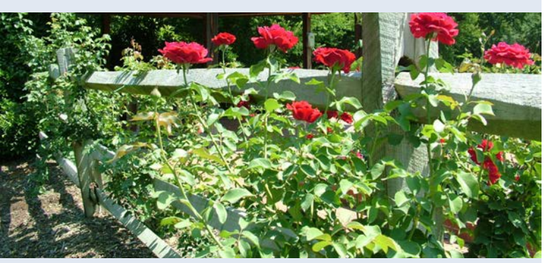
dazzling gardens ...