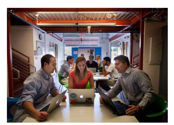
Chapel Hill's emerging entrepreneurial community is led by LaUNCh, an internationally recognized business accelerator program and collaborative venture of the Town, Orange County and UNC-CH.

Chapel Hill's emerging entrepreneurial community is led by LaUNCh, an internationally recognized business accelerator program and collaborative venture of the Town, Orange County, and the University. Demographically, the racial composition of Chapel Hill in the 2020 census was 71% white, 14% Asian, and 10% black. About 7% of the population was Hispanic or Latino of any race.